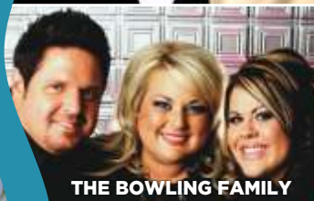
THE BOWLING FAMILY