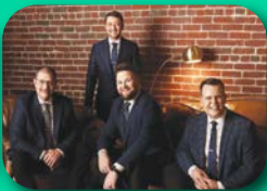
Down East Boys