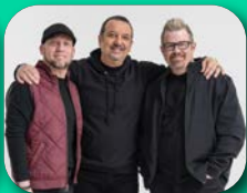
Southbound Cruise Emcees