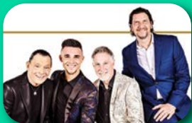
Carolina the Band