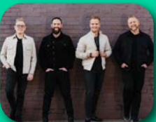
TrueSong Cruise Entertainers