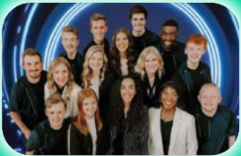
Voices of Lee