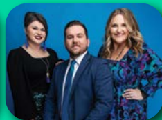
11th Hour Cruise Musicians